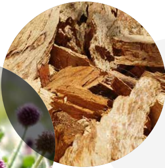
Mangifera indica (Mango bark)