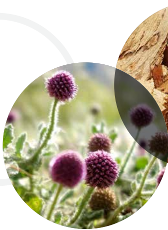
Sphaeranthus indicus (East Indian globe thistle)